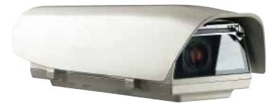
HOV + WIPER