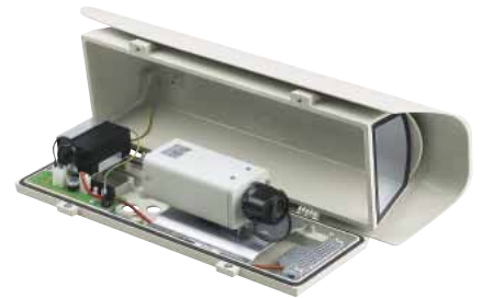
HOV + CAMERA