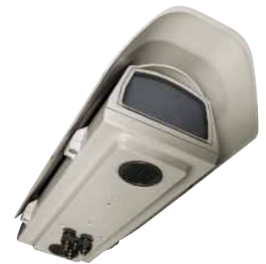
HOV + COOLING SYSTEM

→ VERSION FOR THERMAL IMAGING CAMERAS AVAILABLE: HTV □ 133